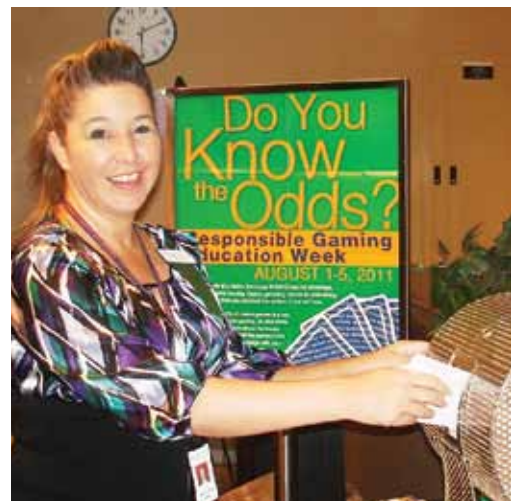
An employee at Ameristar Casino Black Hawk enters her completed quiz into a raffle during RGEW 2011.

With the help of the NCRG, the American Gaming Association helped gaming employees and patrons "Know the Odds" of casino games during the 14 th annual Responsible Gaming Education Week (RGEW). RGEW was held nationwide Aug. 1-5 and encouraged gaming employees and patrons to learn more about the odds of the games as a crucial part of responsible gaming through the brochure "The House Advantage: A Guide to Understanding the Odds." The brochure and educational materials were distributed throughout casinos nationwide and among state problem gambling associations. Gambling Disorders 360°, the NCRG's blog, highlighted various participants' efforts through interviews and blog posts.