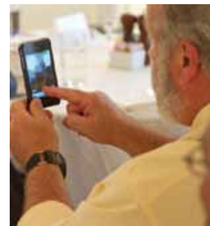
An NCRG Conference attendee captures a picture of the keynote speaker on his phone.

The 12 th annual NCRG Conference was the first time that the event co-located with Global Gaming Expo (G2E), which allowed the NCRG to expand “NCRG at G2E” programming that ran in conjunction with G2E’s corporate social responsibility track. These sessions included success stories of how